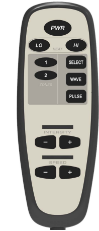
Massage and Heat System

Please read and follow all safety & warning instructions provided below and on the system before using & connecting to the power source. Failure to comply with safety instructions may result in fire, electrical shock, or personal injury and may damage or impair protection provided by the equipment. Please save all safety instructions.